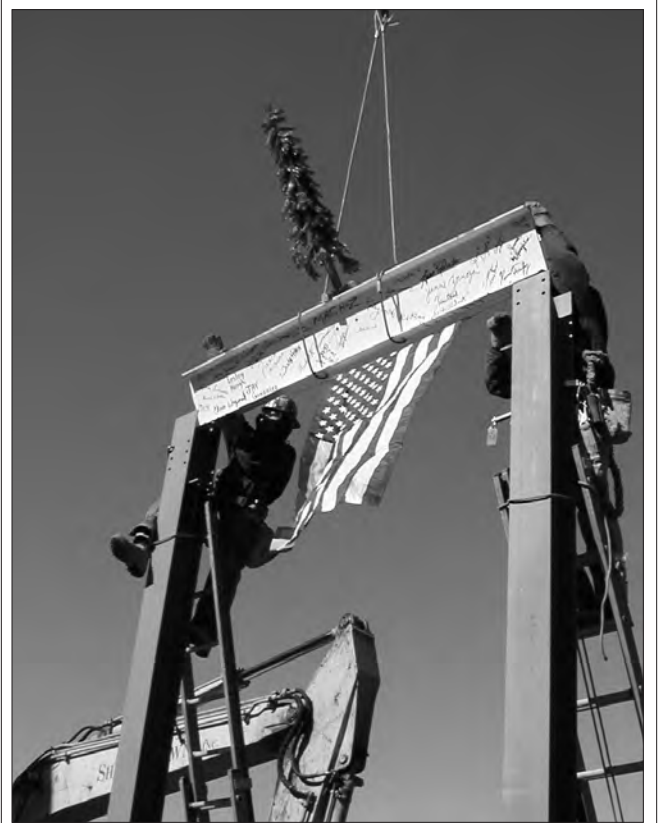
Topping Out Ceremony in February 2005