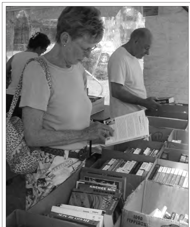
Book Sales are an annual bonanza for book lovers.