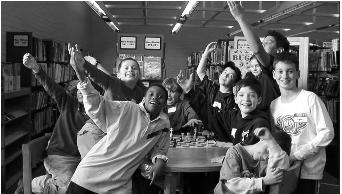
The Library's Chess Club is a favorite with k-12 kids