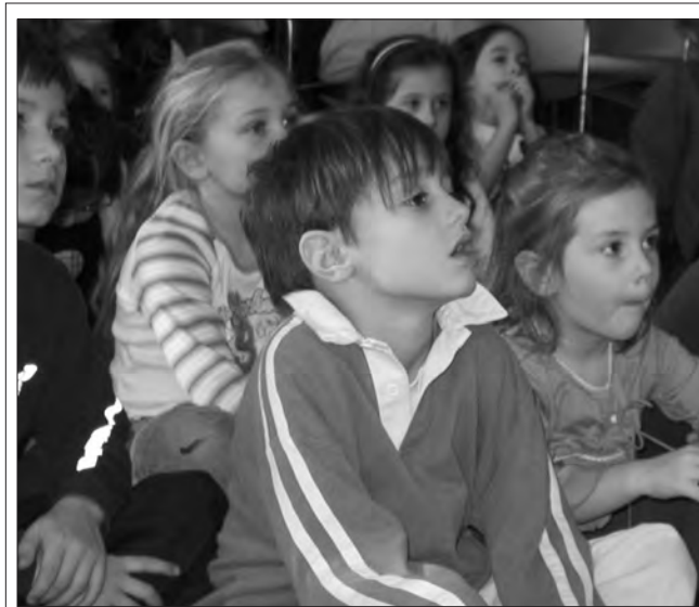
A rapt audience listens to stories. Young Readers are children through age 13 who love to read. They are often children of Friends of the Wilton Library — people who support lifelong learning and realize that starting young is starting right.